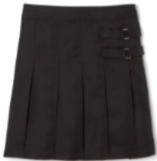
K4 - 12th Grade: Black Bottoms